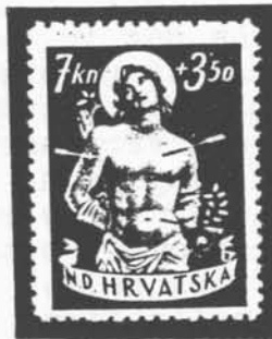
St. Sebastian Scott # B56

When a new pope was elected Sodoma had a fresh chance to work for the Vatican; Leo X was a more broadminded person and liked certain realistic approaches in Sodoma's style. Chigi had to go back to Tuscany and once again brought Sodoma with him to Florence where he entered a horse race; luck was on his side, and he won the race, but since nobody knew who he was when some boys asked him the name of the winner he said, "Sodoma". Innocently the boys repeated loudly his name to the crowd in the square, "Sodoma is the winner, Sodoma, Sodoma!" This irritated most of the elders and the bigots, and Sodoma had to flee with his horse to avoid the anger of the crowd. After this experience Sodoma did not give up participating in horse races, and he eventually won many of them. He used to display all his trophies on the windows and balconies of his house.