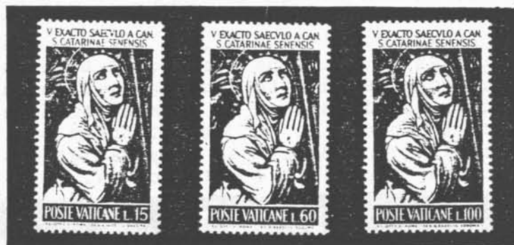
St. Catherine Scott # 335 to 337

When a new pope was elected Sodoma had a fresh chance to work for the Vatican; Leo X was a more broadminded person and liked certain realistic approaches in Sodoma's style. Chigi had to go back to Tuscany and once again brought Sodoma with him to Florence where he entered a horse race; luck was on his side, and he won the race, but since nobody knew who he was when some boys asked him the name of the winner he said, "Sodoma". Innocently the boys repeated loudly his name to the crowd in the square, "Sodoma is the winner, Sodoma, Sodoma!" This irritated most of the elders and the bigots, and Sodoma had to flee with his horse to avoid the anger of the crowd. After this experience Sodoma did not give up participating in horse races, and he eventually won many of them. He used to display all his trophies on the windows and balconies of his house.